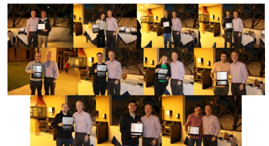
Figure 6: A tribute to employees with at least 15 years of service in the group.

At the end of the day, the group’s anniversary was celebrated with the entire community. A special moment was the tribute to the employees who have been with the group for at least 15 years, half the time of UNISIM’s existence.