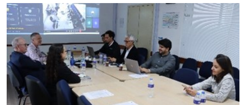
Figure 5: Advisory Board Meeting.

In the afternoon, we had the important Advisory Board Meeting, where representatives discussed their perspectives on research in the field of reservoir engineering.